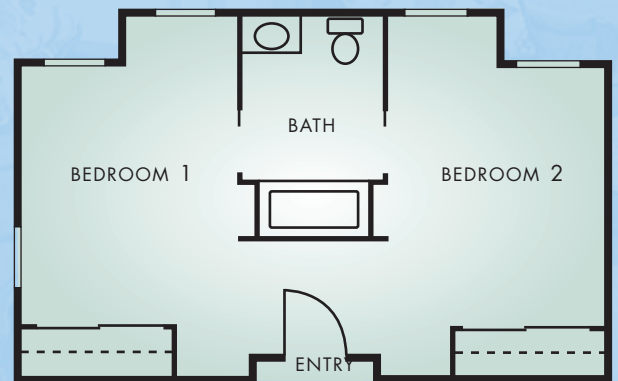
SHARED APARTMENT • 450 SQUARE FEET