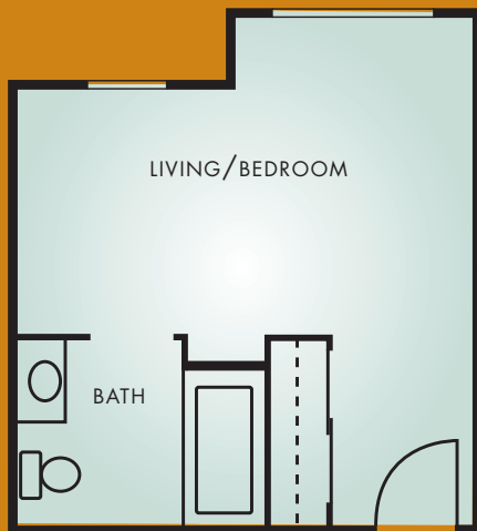
PRIVATE STUDIO • 280 SQUARE FEET